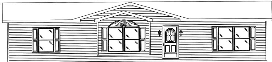
SOME ITEMS SHOWN MAY BE OPTIONAL